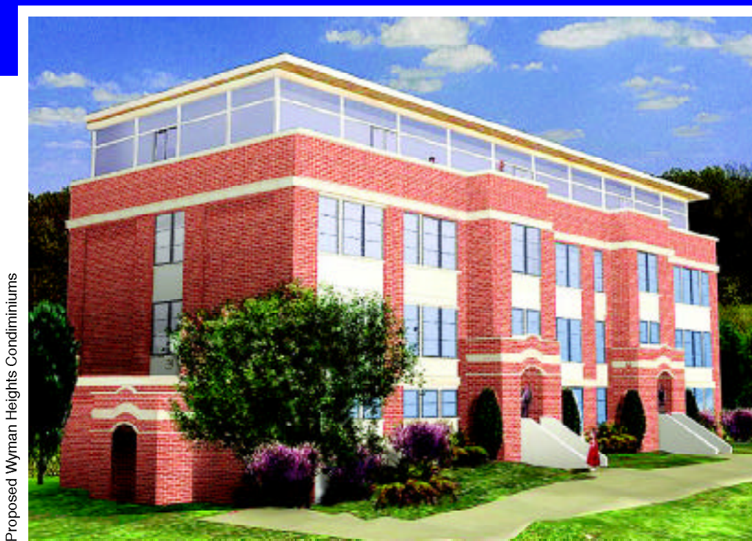
Proposed Wyman Heights Condominiums

October 1, 2005 through September 30, 2006