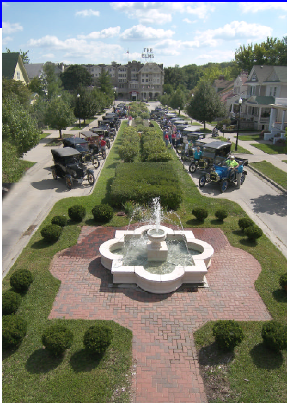
Elms Boulevard Neighborhood is an important historic area