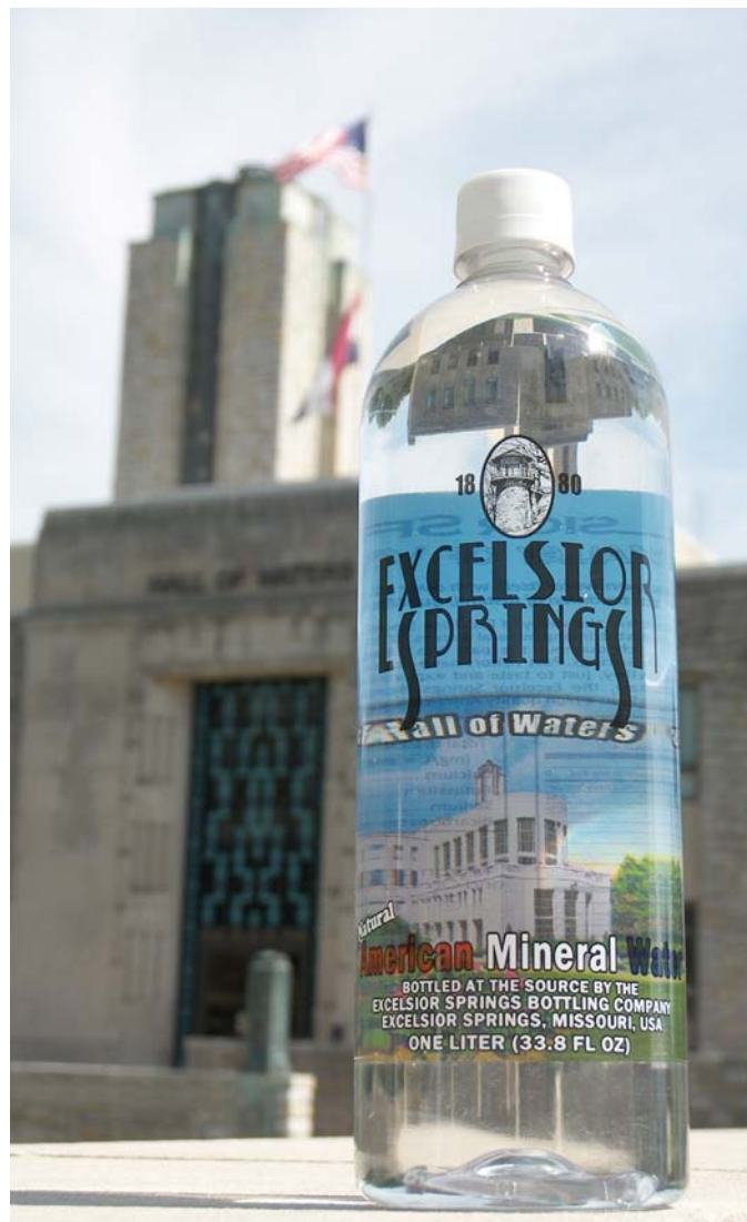
Excelsior Springs calcium water is again available at the Hall of Waters water bar, in local stores and for shipping anywhere in the world.

In August, the ESHPC hired the consultant firm of Winter & Company to produce a City Wide Preservation Plan that will dovetail with the other major planning efforts under way, and enhance those efforts in the area of historic preservation in all of its forms. Phase I of this three phase project was completed in September.