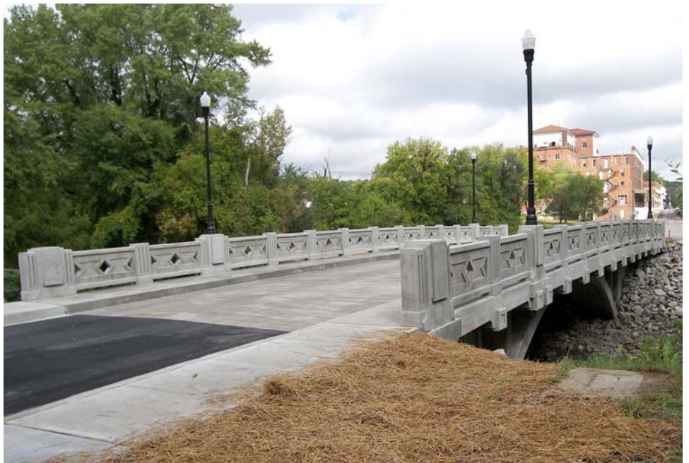
The now completed Marietta Street bridge.

The bridge, which has been closed for construction for much of this year, had been identified as a risk because of deterioration. Its weight limit had been downgraded in recent years, and city officials weren’t sure the structure would pass another inspection before the funds to rebuild it became available.