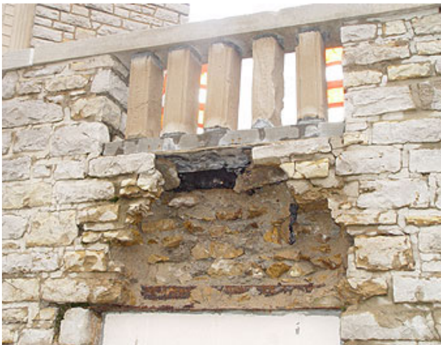
The crumbling blocks between the lintel of a filled-in doorway and a balustrade above are the most obvious problems in the northern side of the west terrace wall at the Hall of Waters, but extensive work must be done on the wall to the left of the photo.

Schutte said it was vital that Excelsior Springs and similar communities fight to keep the program. Without it, she noted, the community's efforts at redevelopment will be severely hampered.